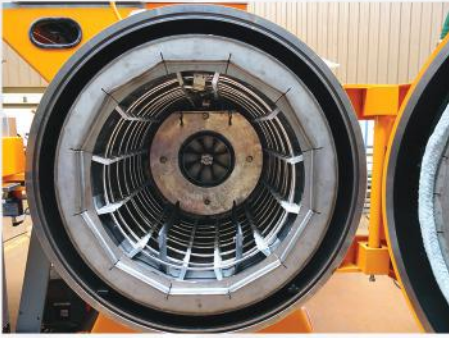
CFC hot zone for high temperature applications